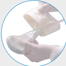
3D Contour Seamless